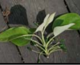
Tupelo Gum