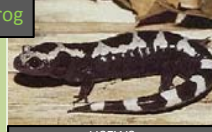
USFWS Marbled Salamander