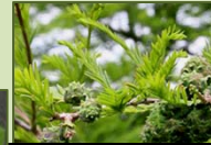
Bald Cypress