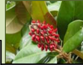
Southern Magnolia