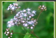
Purple Mist Flower