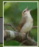
Swainson's Warbler