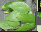
American Beech