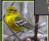
Pine Warbler