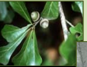
Water Oak