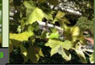
American sycamore