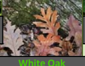
White Oak