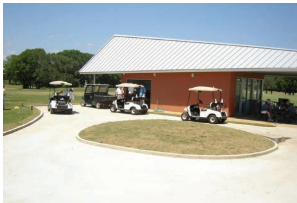
New Concession Building