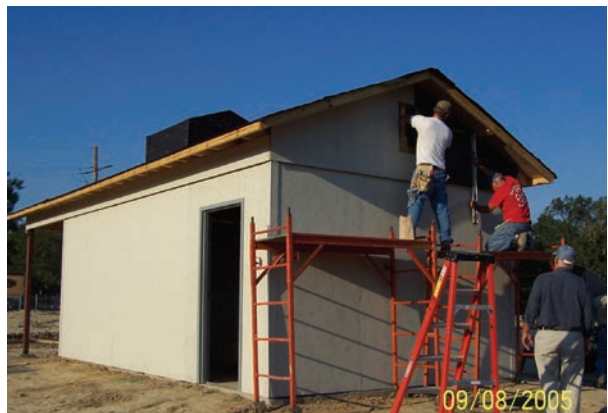
New Pump House Siding