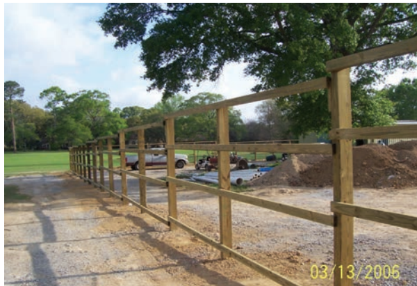
Fence to Enclose Webb Maintenance Area