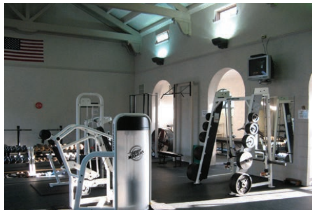
New Fitness Center at Webb