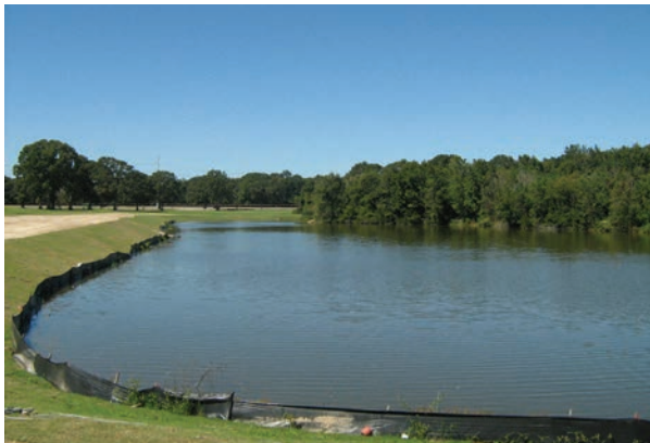
Cleared Tree Line Along Lake & The New #1 Hole