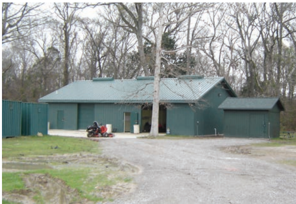
New Maintenance & Cart Building