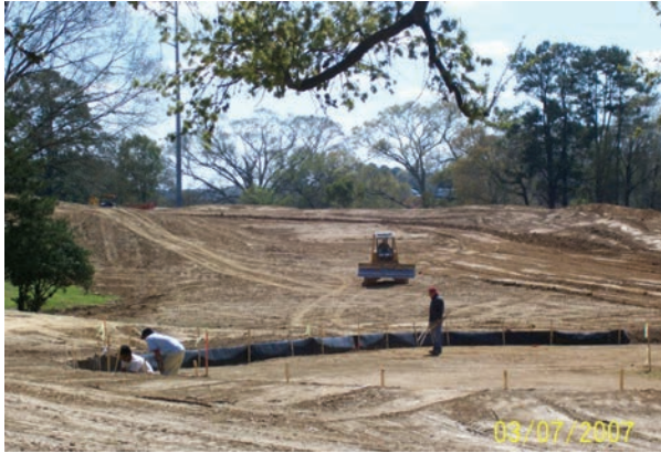
Earthwork at Hole 9