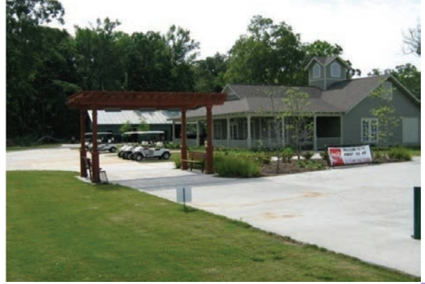
New Club House with Pro Shop & Classroom