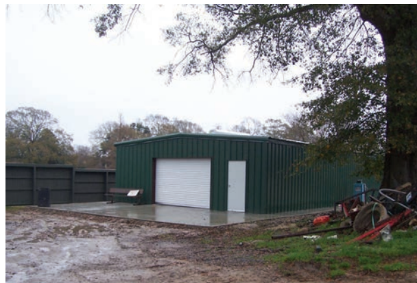
Maintenance Building Complete