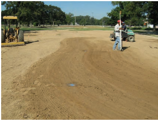
Golf Course During Construction