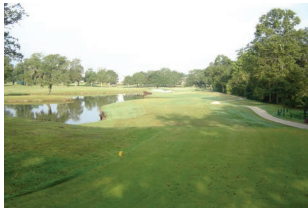
View of #5 From New Tee