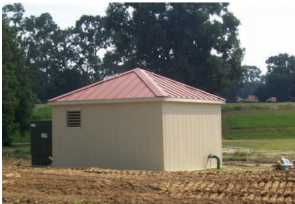
New Pump House