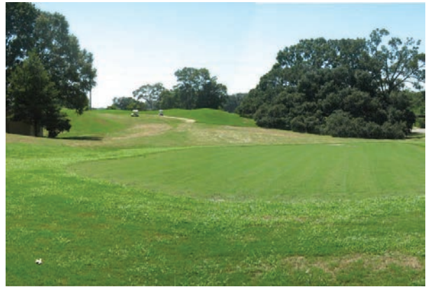
Hole 9 After Renovation