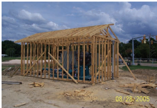
New Pump House Framing