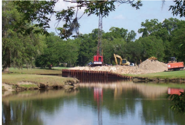
Sheet Pile Rep