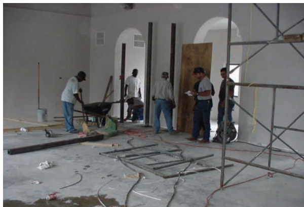
Fitness Center Under Construction