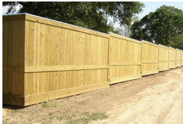
New Maintenance Yard Fencing