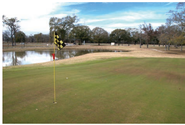
View of the New #16 Hole