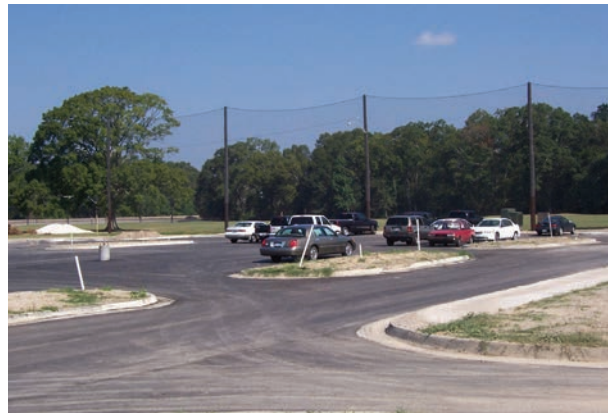
New Parking Lot