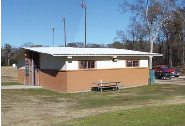
Old Pro Shop