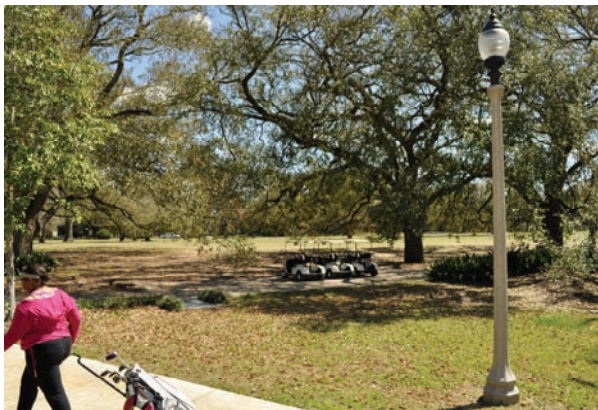
Golf Cart Staging Area Under the Oaks