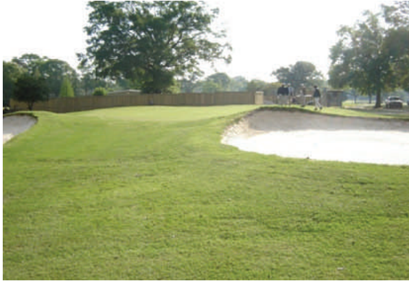
#1 Green & Bunkers