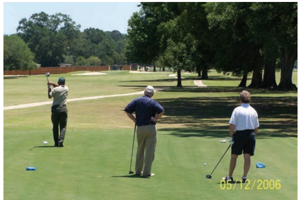
Webb Grand Opening Invitational Tournament