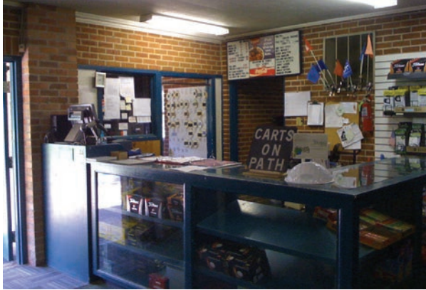
Old Dumas Pro Shop