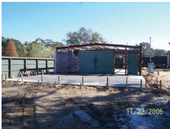
Maintenance Building Renovation