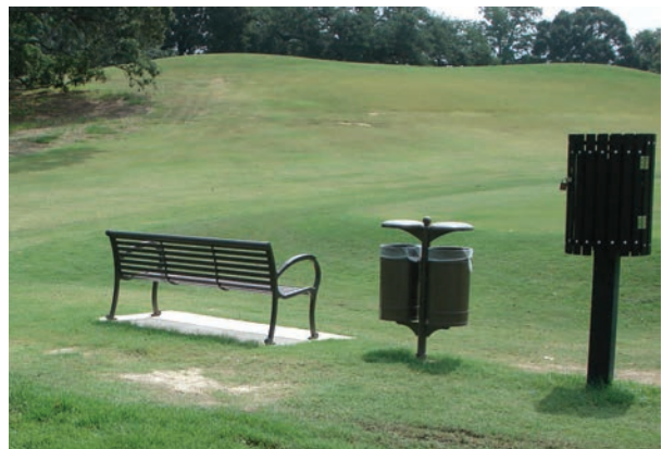
New Site Furnishings