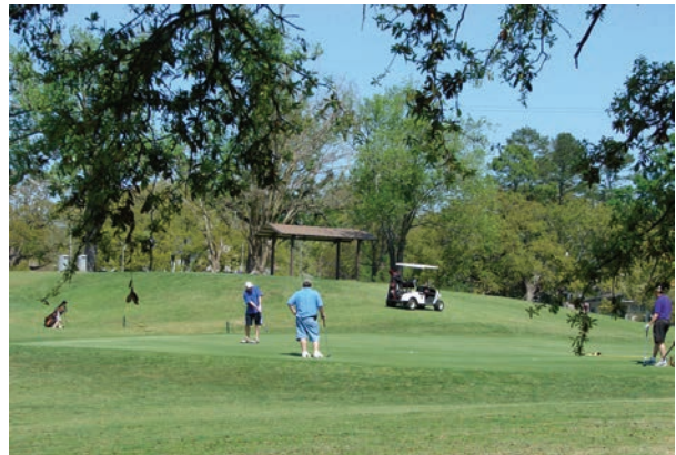
Golfers Playing on the Renovated Course