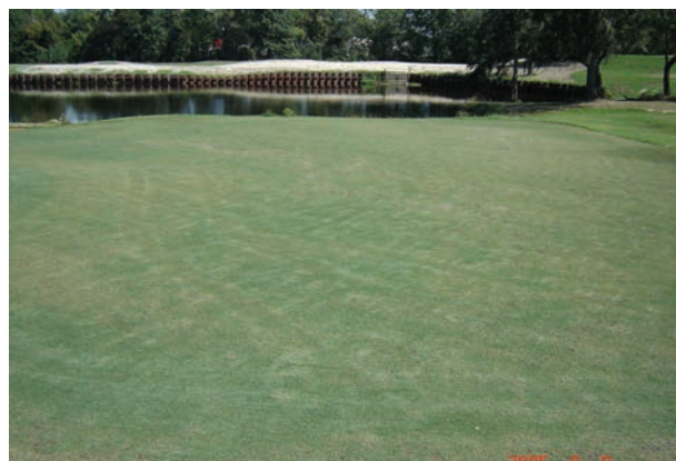
Grown In At 6 Weeks