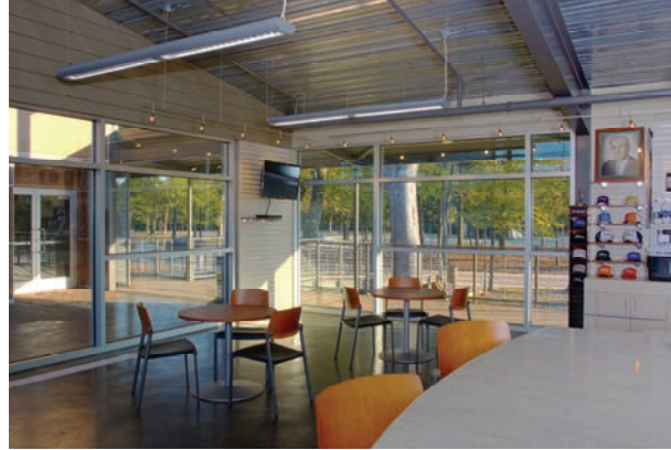
New Dumas Pro Shop & Waterfront Cafe