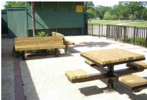
New Club House Tables & Benches