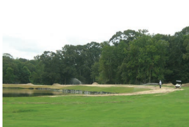
View of Previous #16 Hole to the New #1 Hole