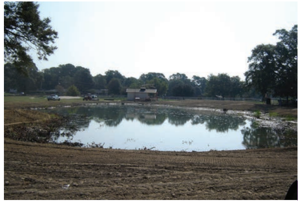
New Lake & Pump House