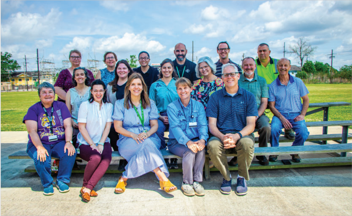
BREC PLANNING & ENGINEERING DEPARTMENT