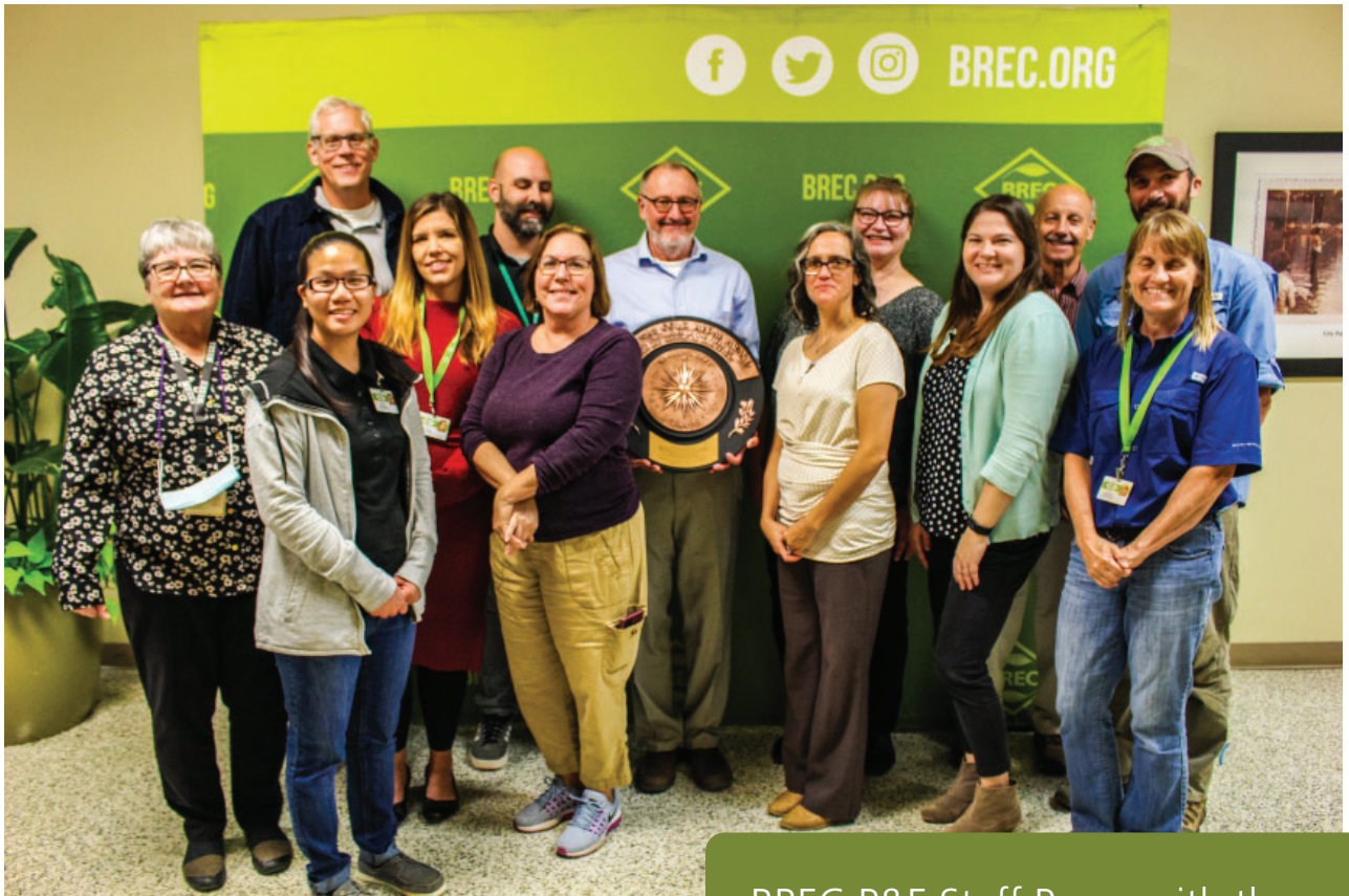
BREC P&E Staff Poses with the NRPA Gold Medal, 2022