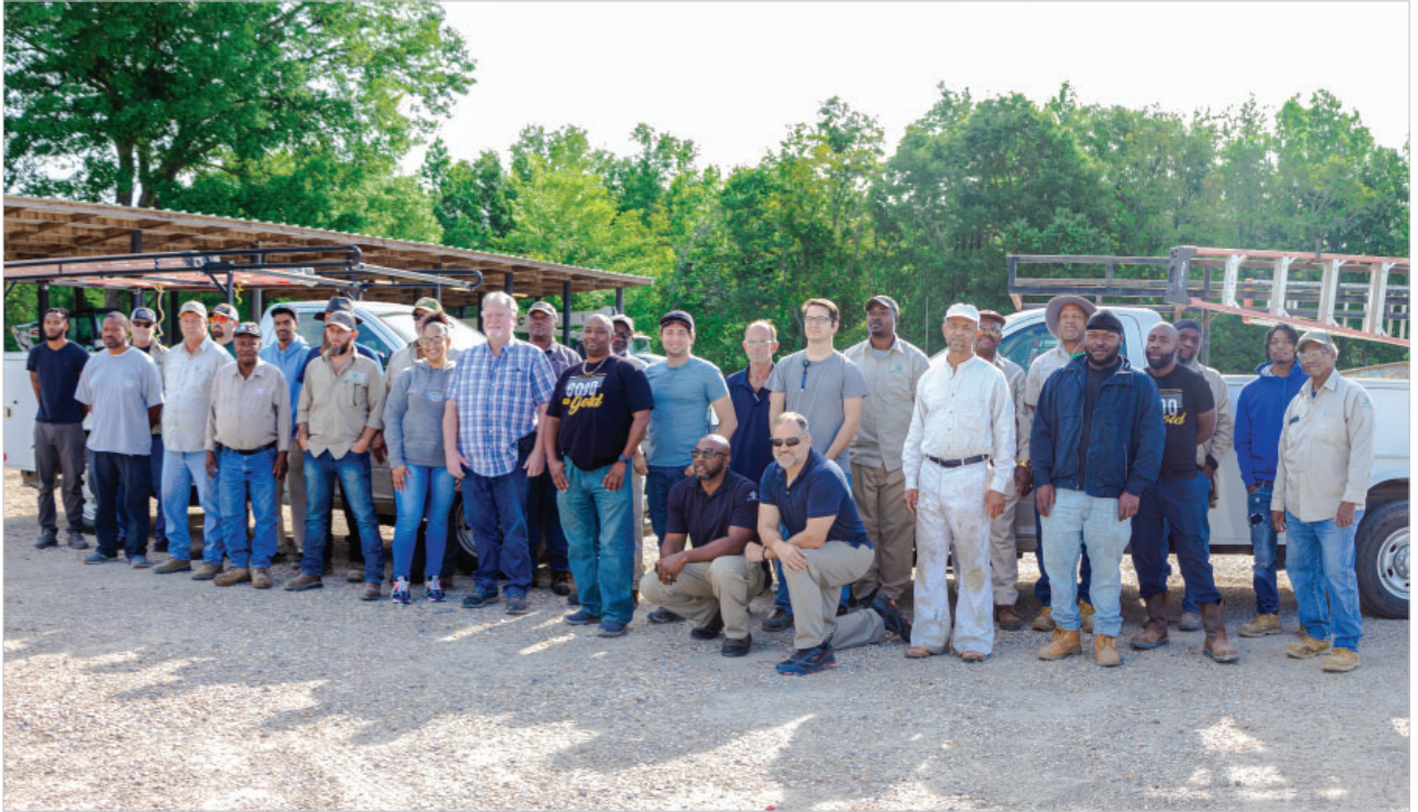
BREC CAPITAL CONSTRUCTION DIVISION