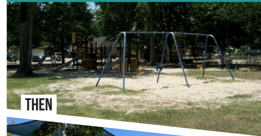
HOWELL COMMUNITY PARK