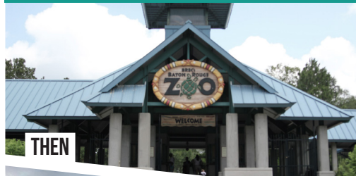
BREC'S BATON ROUGE ZOO