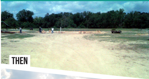
ZACHARY COMMUNITY PARK